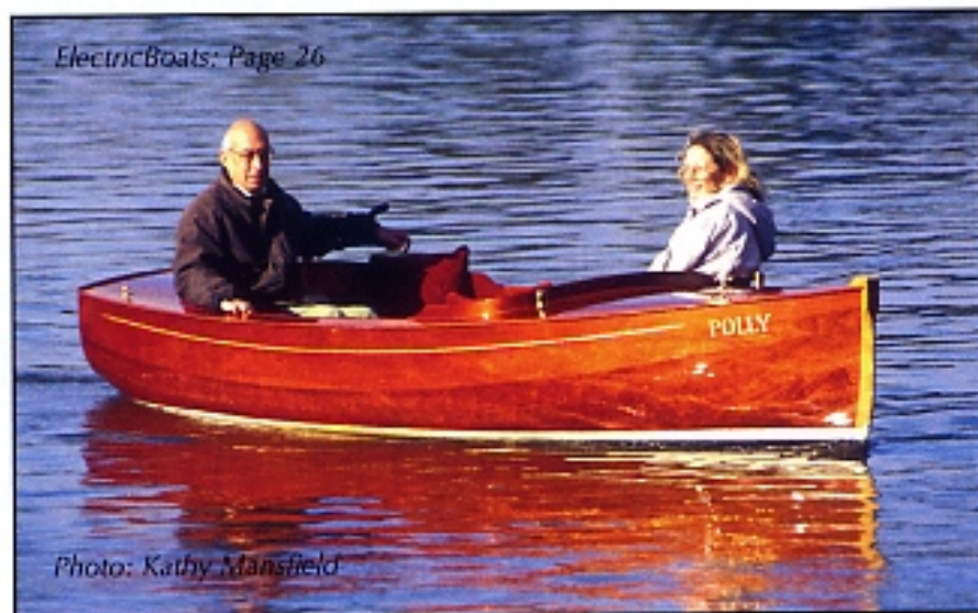
ElectricBoats: Page 26