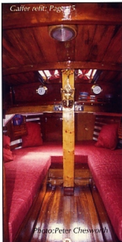
Gaffer refit: Page 15